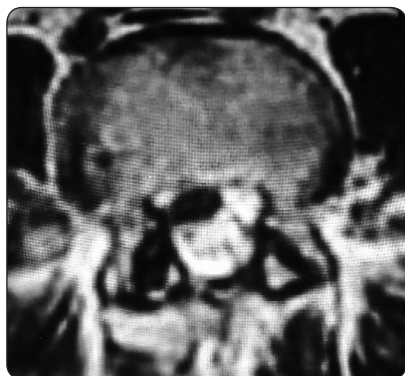
Figure 1. Right recurrent L4/5 disc herniation. The patient underwent initial wide laminectomy and extensive right discectomy in the initial surgery. Right sciatica relapsed after 10 months of pain relief. Redo surgery fulfilled satisfactory results.

By comparing the degrees of pain relief following revision surgeries to those following initial surgeries, we found 20 cases (67%) with less pain relief, 3 cases (10%) with equal pain relief, and 7 cases (23%) with more pain relief after the redo surgeries. All cases with initial minimally invasive surgeries, except one case (86%) reported more than 75% of pain relief, and consumed relatively shorter operative time; which may be due to less extensive epidural scar (Figure 4). The majority of the whole cases (70%) developed no complication following redo surgeries. Sixty-seven percent of patients reported satisfactory results, while 20% had accepted results. We considered both results (87% of cases), as success. Unsatisfactory (Failure) results were found in 13% of cases due to either poor improvement of pain or development of a major complication. One case developed a postoperative foot drop as a result of root injury during discectomy of recurrent L4/5 disc. Another case developed persistent CSF fistula that necessitated surgical repair. Detailed data about pain relief, complication rate and outcomes are listed in Table 2. We also compared outcomes between diabetic and non-diabetic patients in terms of pain relief, complications, and success rates (Table 3).