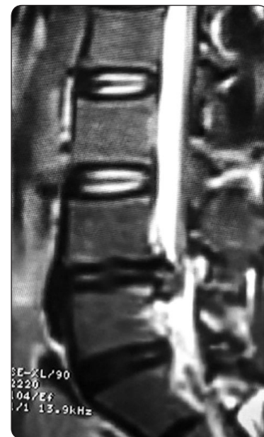
Figure 3. A case of recurrent L4/5 lumbar disc herniation. Intradural rupture was found intraoperatively. Redo surgery resulted in an accepted result.