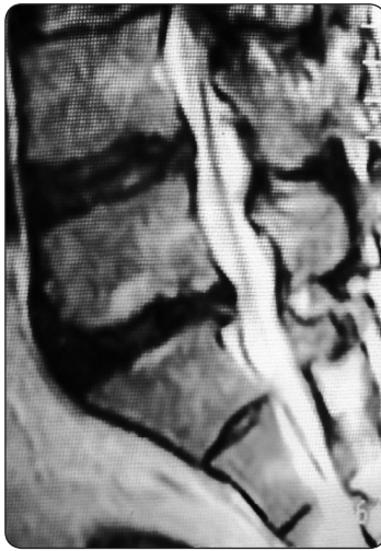
Figure 4. A case with recurrent L5/S1 herniation. Note the minimal scarring at the interlaminar space.